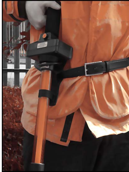
Figure 3 – Wand Holster

Spares/Additional components for the system include replacement standard, IR and NVG bulbs, additional sleeve lenses, wand holsters (shown in Figure 3) and wand lanyards (neck holder).