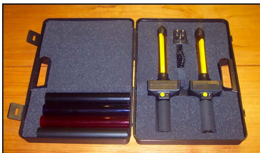
Figure 2 – A pair of Seal NED Wands in carrying case

Figure 2 shows a pair of SEAL NED Wands in their carrying case (available end of 1 st Quarter 2005), complete with charger and additional sleeve lenses.