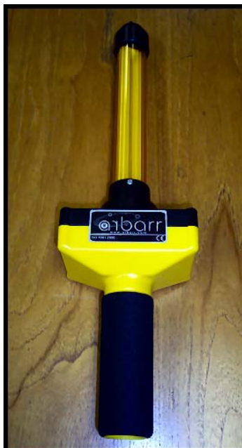
Figure 1 – The Seal NED Wand

The SEAL NED Wand, shown in Figure 1, is a rechargeable multi intensity marshalling wand.